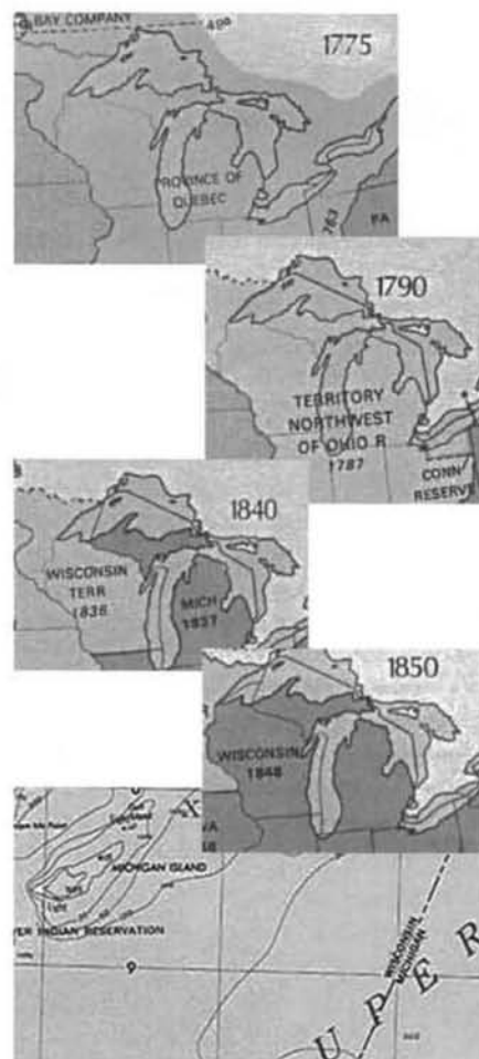
From top to bottom, the five variations of the Michigan-Wisconsin border over time. Maps courtesy of the author.

Misnomer: That all light vessels were named for the stations at which they served, such as "NANTUCKET, DIAMOND SHOAL, PORTSMOUTH etc.