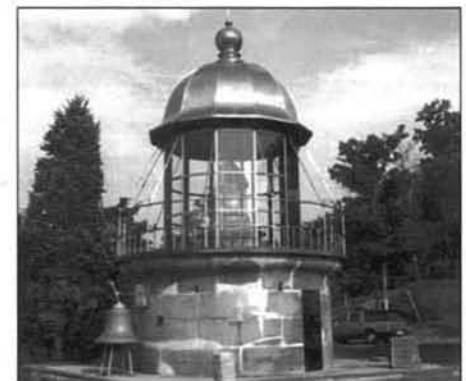
Below – Replica of Minots lantern room with what remains of the original lens.