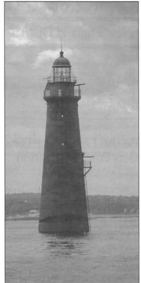
Above – Minots Ledge Lighthouse in Massachusetts Bay.

ignations to go with them. If he had assigned 1-3-4 to Minots Ledge then it might have been called the "I you love" light or whatever else an active, romantic imagination could create. As myths go this is a nice harmless one, it just shouldn't be taken to be historic fact. Once again, I invite readers to contact me if they have any stories about lighthouses, lenses or the USLHS that seem just a little too cute or strange to be true.