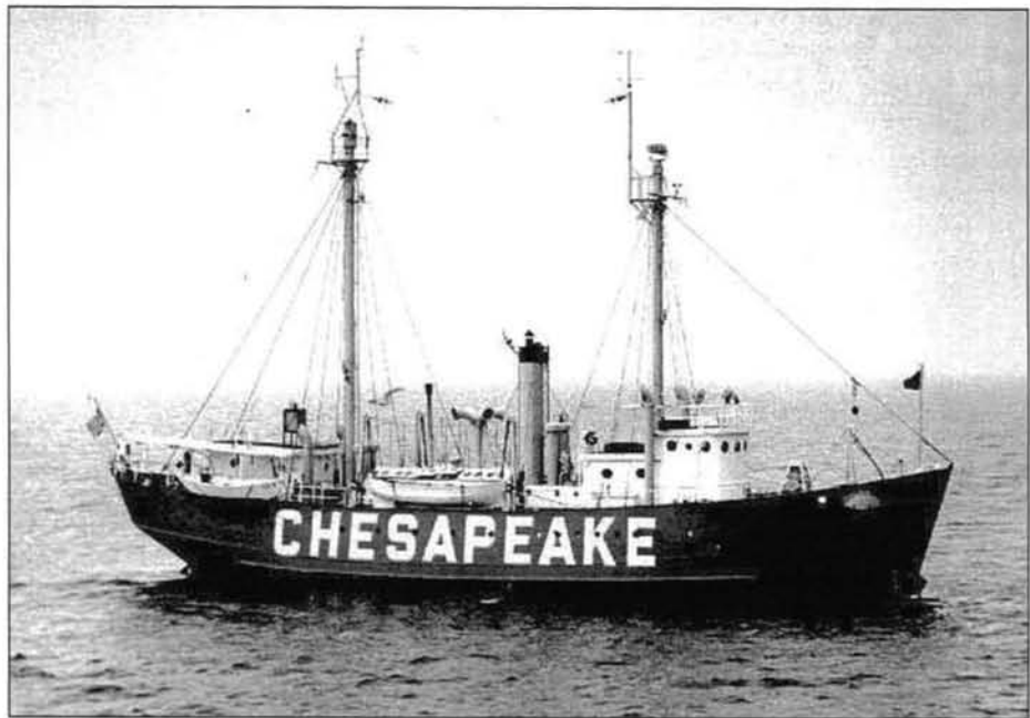
Lightship CHESAPEAKE LV-116, WAL 538.

Myth: The design of the 1866 lighthouse in Marquette, Michigan was patterned after a Spanish mission.