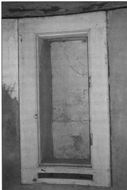
Door at the top of the weight shaft. Note the slot at bottom for the (missing) shelf.

This was the only use for these shafts. They did not contain little elevators or dumbwaiters so that the keeper could avoid carrying his oil or his tools or anything else to the top to