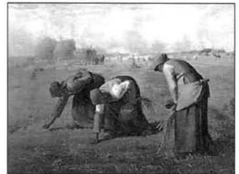
Jean-Francois Millet's painting of French women working in the fields. A very unlikely place to be polishing a Fresnel prism! Illustration courtesy of the author.

works depict men and women farmers toiling in the fields of France. Then I try to picture the women in these paintings lugging a five to 15 pound chunk of extremely brittle lens glass