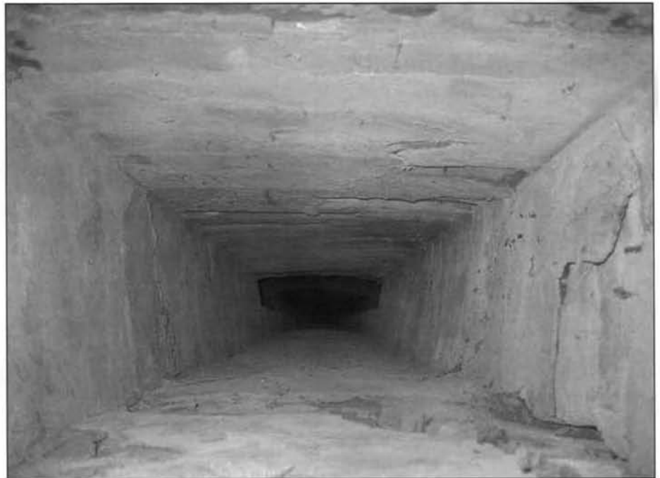
Two views of the weight shafts built into the walls of many lighthouses. Above, looking down the shaft, and below, looking up the shaft in another tower.