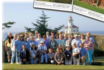
Society Members Tour Cape Arago Lighthouse, Oregon

To Join the U.S. Lighthouse Society and begin your subscription to The Keeper's Log Magazine... Call - 415-362-7255 or visit our website at www.uslhs.org